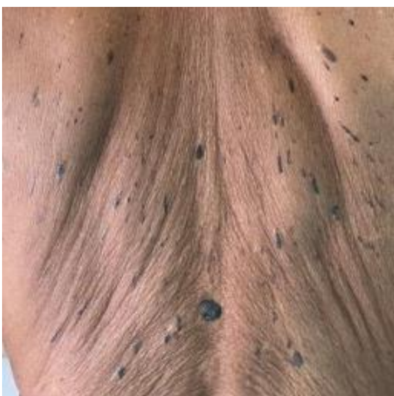
Figure 1, 2. Multiple seborrheic keratosis distributed