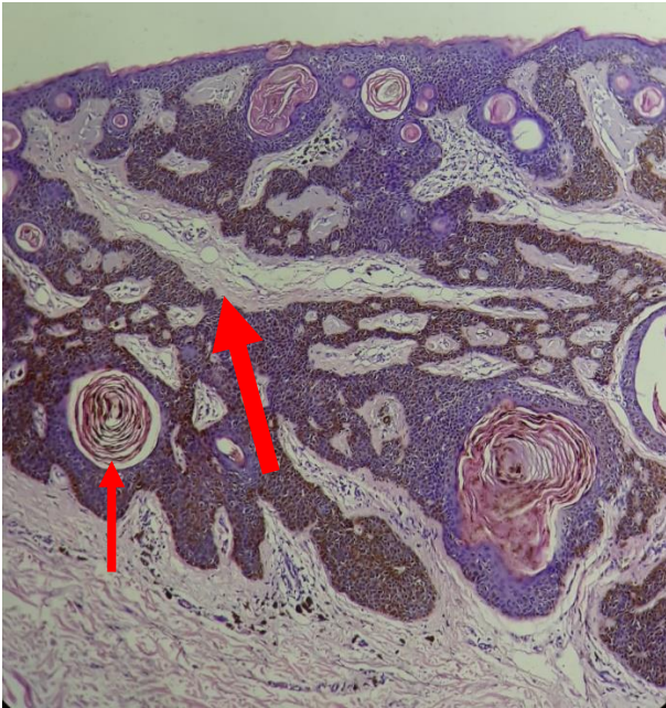
Figure 4. Keratin cyst. HE10x10.